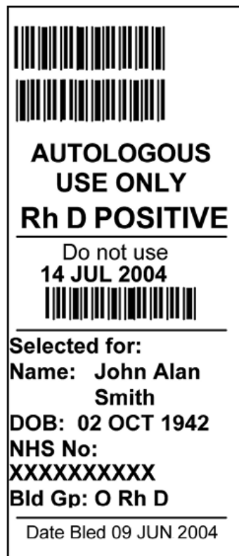
Figure 23.6 Label for unit with use limitations